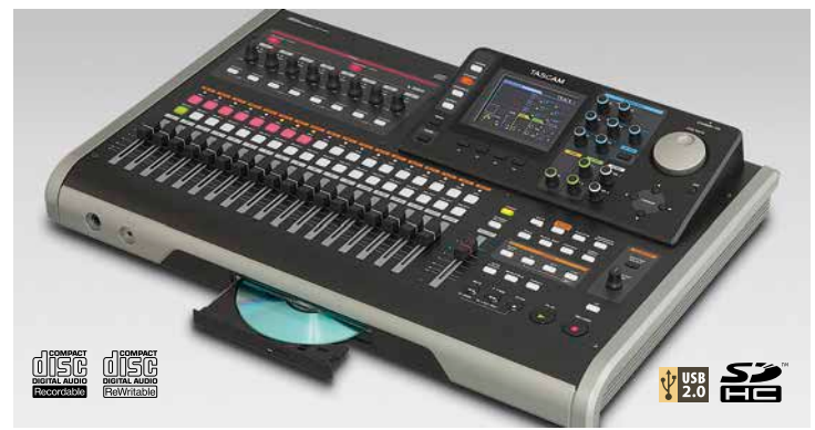
DP-24 DIGITAL PORTASTUDIO