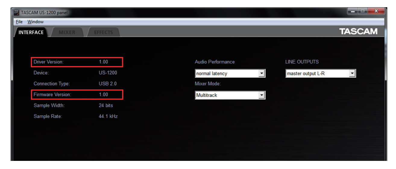
Windows US-1200 Mixer Panel