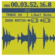
Waveform screen with variable zoom