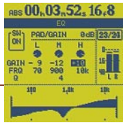
Parametric EQ screen