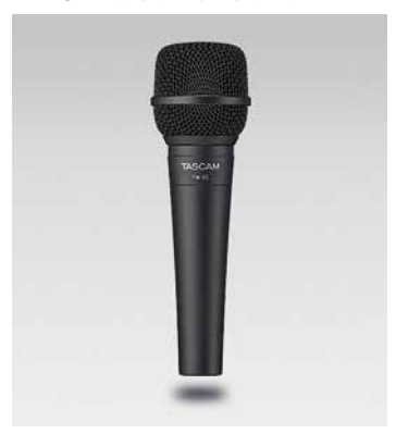
TM-82 PODCASTING MICROPHONE