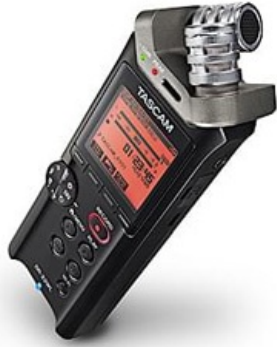
DR-22WL: Handheld Recorder with Wi-Fi functionality