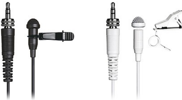
TM-10L: Lavalier Microphone With Screw-Lock Connector