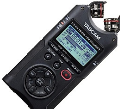
DR-40X: Portable Four-Track Digital Audio Recorder and USB Audio Interface