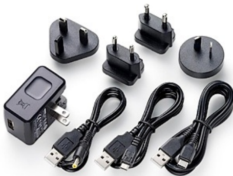
PS-P520U: 5-Volt AC Adapter