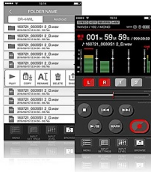
DR Control: Remote app for DR-series recorders